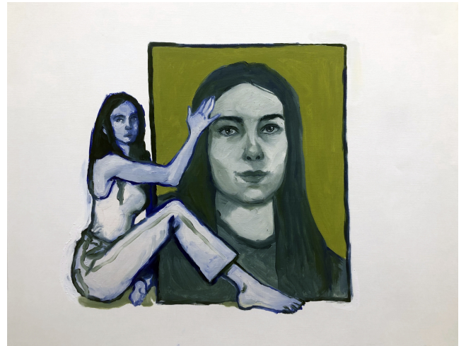
Memento Mori (2020) £340