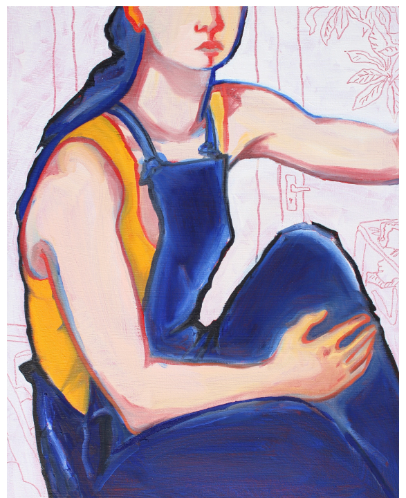
The Artist in Her Studio (2021) £490