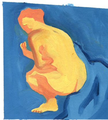
Ink and oil drawings (various) between £40-£100, please enquire