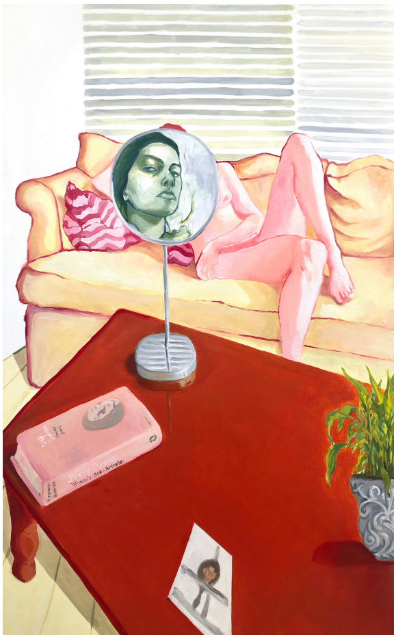
Interruption (2020) £1300