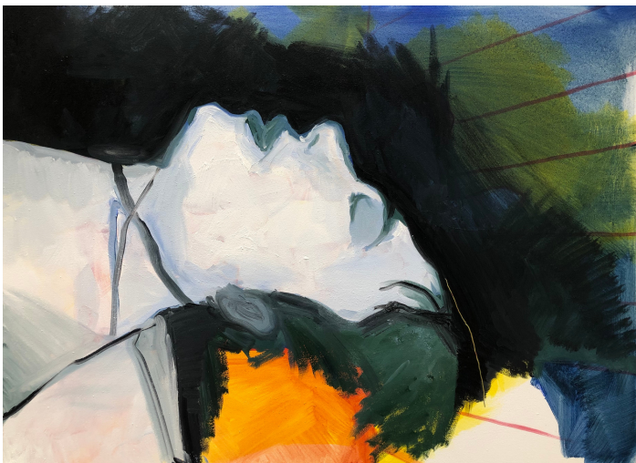
Sterner (2020) £540