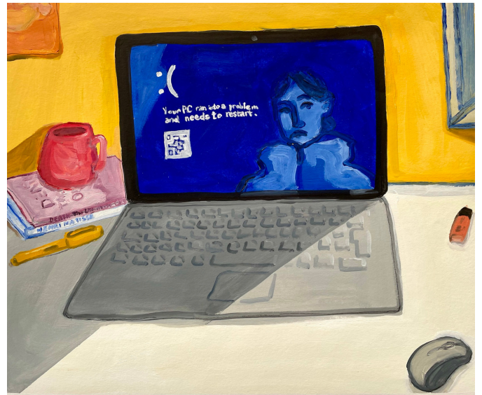
Self Portrait in Blue Screen of Death (2021) £280