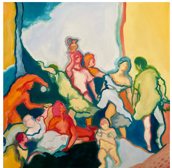
Bacchanal (2021) £660