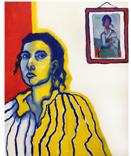
Me and Modigliani (2019) £380