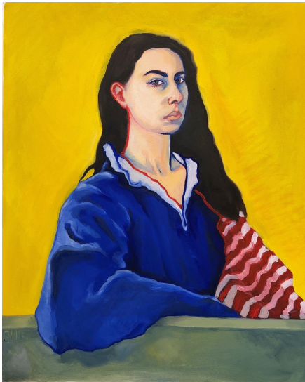
Girl with Blue Sleeve (2019) £570